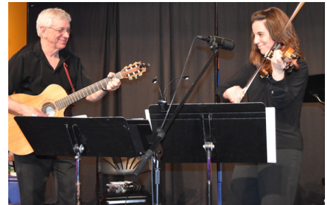
The Pic and Bow