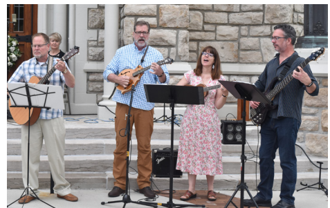
String Theory Quartet