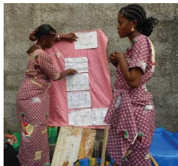
A women's microcredit and savings project with The Community of Disciples of Christ in Congo was a recipient of the special Easter offering.