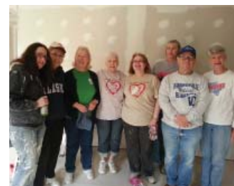
2013 Mission Team