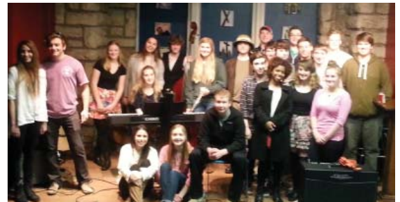
High School Music Night on Jan. 18