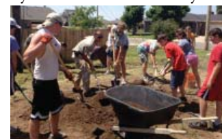
2012 Mission Team