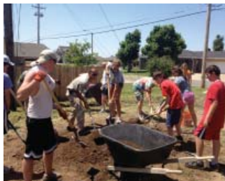
2012 Mission Team