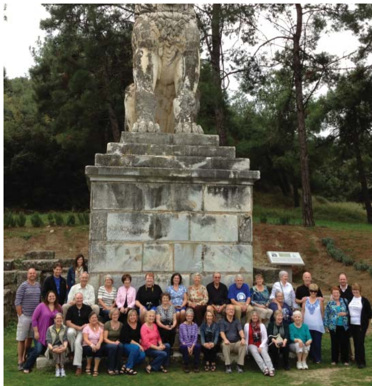
The group enroute to Philippi. In front of a 4th century BC funerary monument for a companion of Alexander the Great.