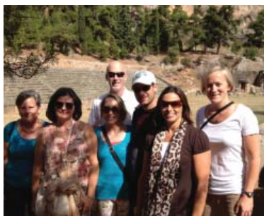
Members climbed to the top of the Oracle at Delphi.

Members and friends of Country Club Christian Church traveled in the footsteps of Paul Oct. 8-18. Beginning and ending in Athens, the group visited the ancient cities of Corinth, Ephesus, Patmos, Herkalion, Santorini, Delphi and Thessaloniki.