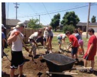
2012 Mission Team