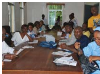
Training local populations about the danger