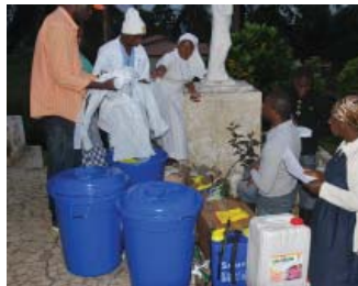
Personal protective equipment for health care workers

Please pray for our brothers and sisters in West Africa and give generously to this year's Christmas offering. Mark your gift "Christmas Offering" and mail it to the church office, or drop it in the offering plate on Sunday.