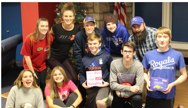
High School Youth Group celebrated the season with a Christmas Party Lock-In.

The next service opportunity at Micah Ministry will be on Mon., Jan. 8. Meet in the chapel lot at 4:30 p.m. to carpool. Return to church at 7:30 p.m.