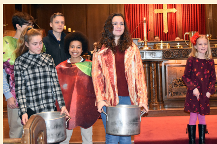
The Student Ministry raised over $900 for the Virginia Reed Food Drive, as part of the Souper Bowl of Caring on Sun., Feb 4.