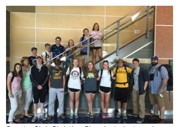
Country Club Christian Church students and adults on the mission to Nicaragua June 2-8.

Our Student Ministry Team is beginning to plan for our next high school trip to Nicaragua in 2019. Join our students as they present their experiences Sun., July 10 at 10:00 a.m. in the Social Hall.