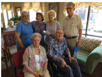
Prayer Ministry on the Road at Foxwood on Aug. 18

Our Prayer Ministry will be on the road Thur., Sept. 15, 10:30 a.m. at Claridge Court Senior Living Community (8101 Mission Rd, Prairie Village, KS 66208). Everyone is welcome to join us for prayer, a simple service with communion, and fellowship. We will gather with Claridge Court's residents in their "Pub" from 10:30-11:00 a.m. For information, contact joew@cccckc.org .