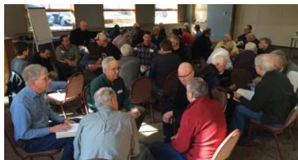
Men's retreat in 2016.

These retreats will be the same as those offered this year. If you missed out, this is your chance to experience the renewal provided to all participants. Life gets busy and it is easy to drift away from the journey of faith. The retreats are designed to build friendships, provide personal reflection time, and have fun while also reconnecting with the Spirit of God. Participants will learn new forms of prayer and spiritual patterns, enjoy the beauty of nature, and have time to relax and play.