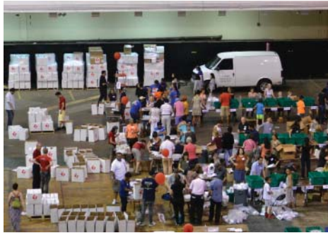
Preparing hygiene kits

Our annual Christmas Offering is a way for our church to extend its reach and to carry out the Christian mission to help others in need. Heart to Heart is making a difference in the lives of many people, and they deserve our support.