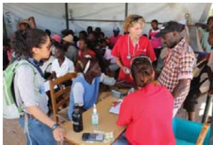
Clinic in Haiti

for our Christmas offering. This season’s offering will be directed to a local charity, Heart to Heart International. Heart to Heart continues to provide relief and help for the victims of Hurricane Matthew, and these efforts are what led us to choose Heart to Heart as our offering recipient.