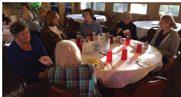
Women's retreat in 2016.

Cost is $125 per person. Early registration is $110 by Jan. 15 for men's retreat and by Aug. 15 for women's retreat.