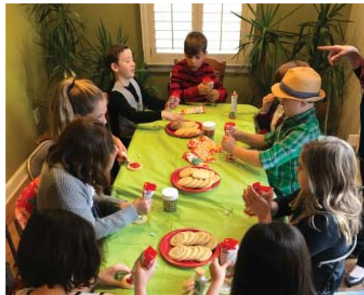
Club Kids (grades 3rd-5th) gathered for holiday fun and service on Dec. 4.