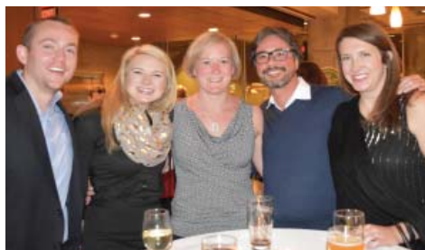
The 2016 Celebration Dinner and Auction.