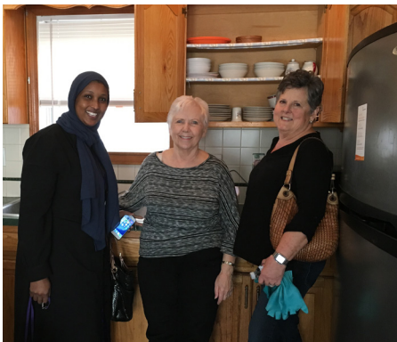
Working with our partners at Della Lamb Community Services, a team set up a home for a family of eight refugees from the Congo.

Opportunities to serve this spring include delivering a flower to a shut-in and organizing our summer blood drive. Spring is also the time to plan our summer blood drive. We are looking for help coordinating with the blood center and recruiting donors. For information: joew@cccckc.org .