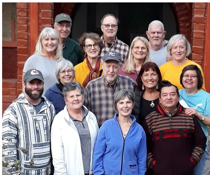
Our recent service/learning trip with FEDICE in Otavalo, Ecuador after spending the weekend at cultural sites and ready to start the "MINGA," working together with the people of Otavalo.

Visiting our international partner ICDCPR – the Christian Church (Disciples of Christ) in Puerto Rico to be present in the community and continue efforts to rebuild homes and lives following the disaster of Hurricane Irma in 2017. This year's trip will focus on "young adult" members for a long-weekend trip, however, all are welcome! Cost TBD (approx. $1,000).