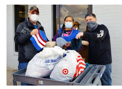
Warm hats and scarfs made by our Knitting team were delivered to mission partner Cross-Lines Community Outreach this week.

Metro Mission is gathering new or gently used blankets and tarps for sharing with our mission partners who serve the homeless in the metro area. Twin or full size blankets and tarps approximately 5 x 7' are most useful. Donations may be dropped off at church Monday - Friday 8:30 a.m-3:30 p.m. at the East entrance.